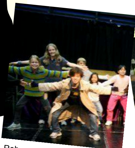
Rehearsing the final dance