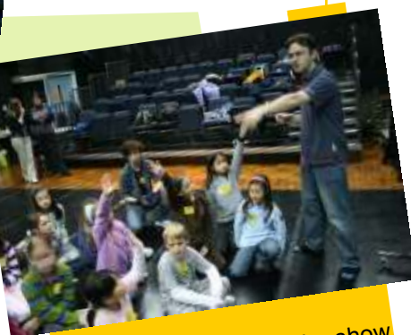
Brainstorming ideas for the show